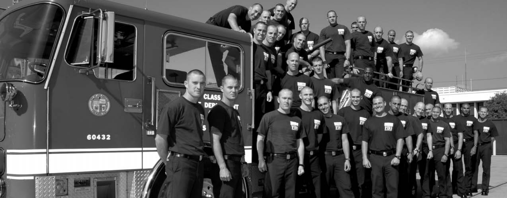
Above: New LAFD members. Drill Tower 40 graduates. October 2006